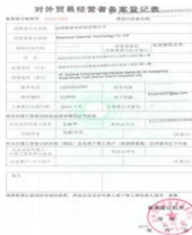
Export Experience Rights Record